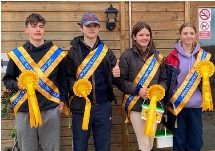
Evenlode Junior team: